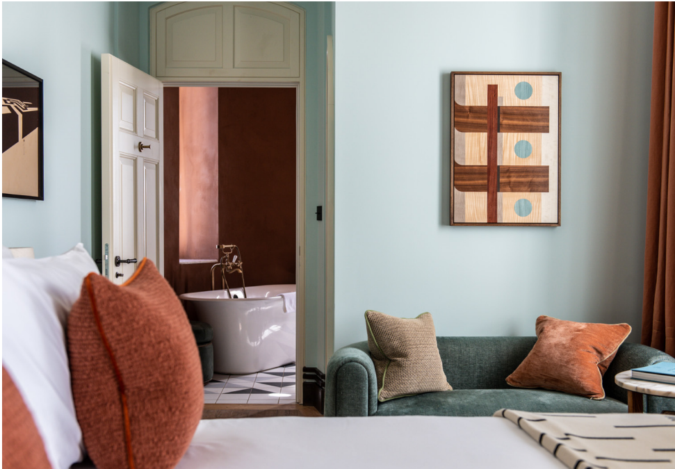
A Big bedroom with an en-suite bathroom and freestanding bath